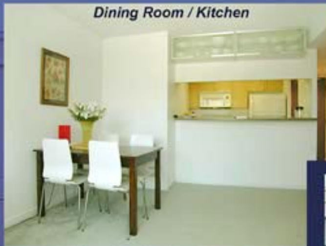
Dining Room / Kitchen