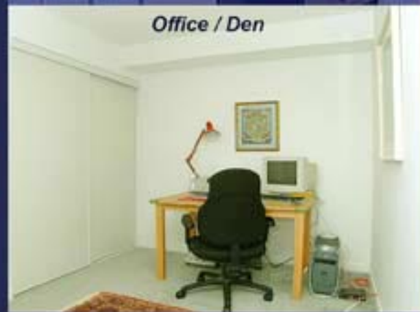
Office / Den