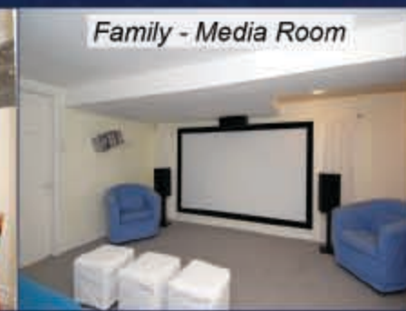
Family - Media Room