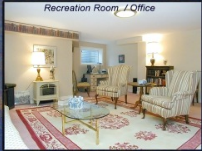
Recreation Room / Office