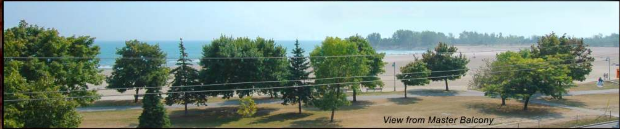
View from Master Balcony