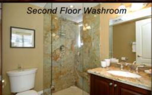
Second Floor Washroom