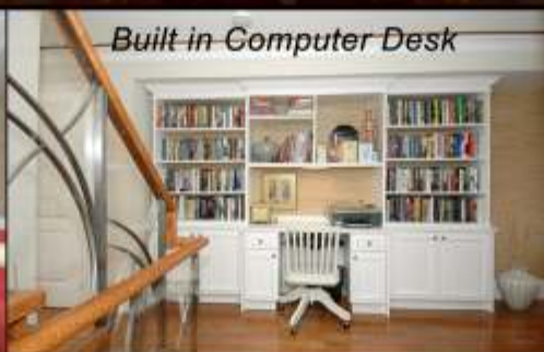
Built-in Computer Desk