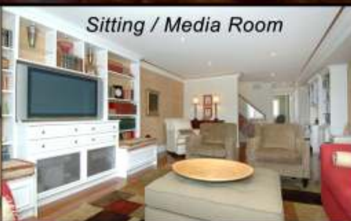
Sitting / Media Room