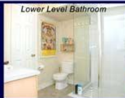
Lower Level Bathroom