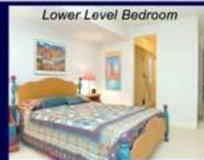
Lower Level Bedroom