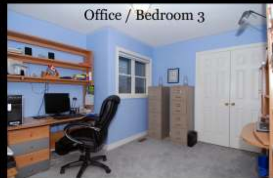
Office / Bedroom 3