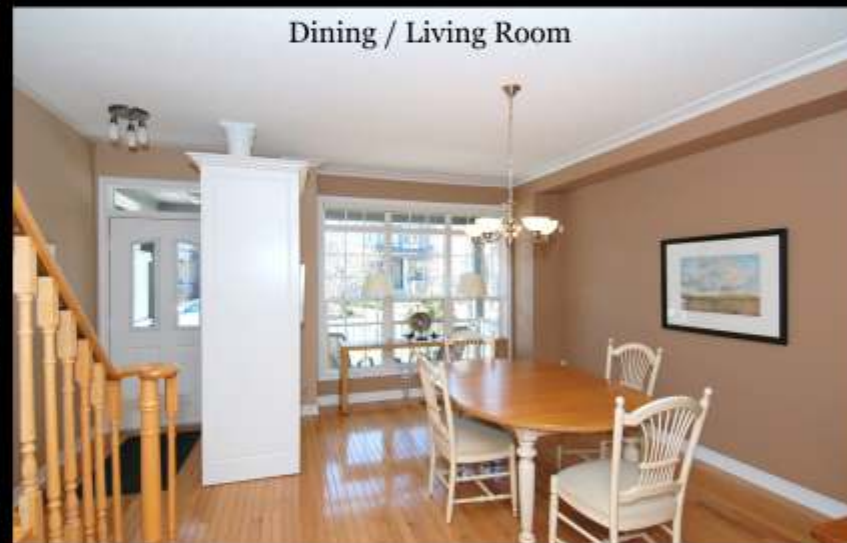
Dining / Living Room