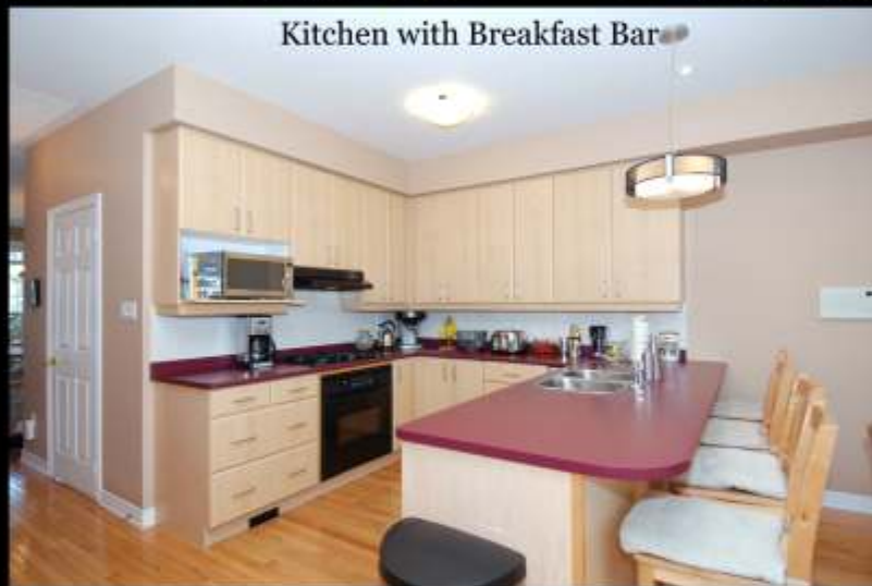
Kitchen with Breakfast Bar