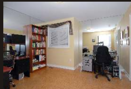
Office / 3 rd Bedroom