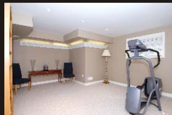
Exercise Room / 4 th Bedroom