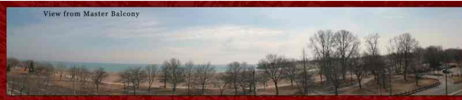
View from Master Balcony