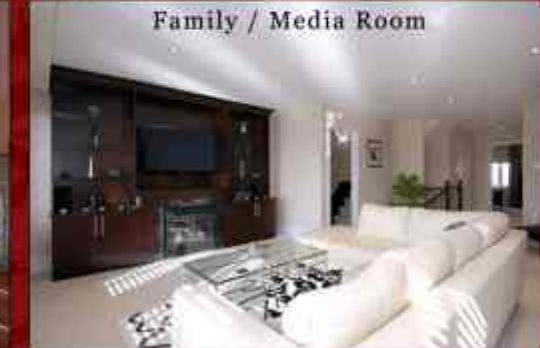
Family / Media Room