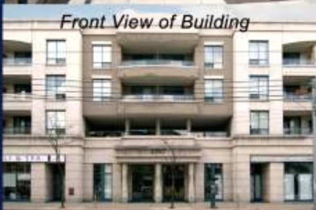
Front View of Building