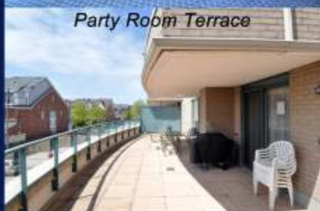
Party Room Terrace