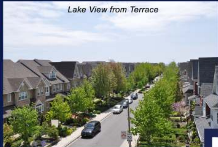
Lake View from Terrace