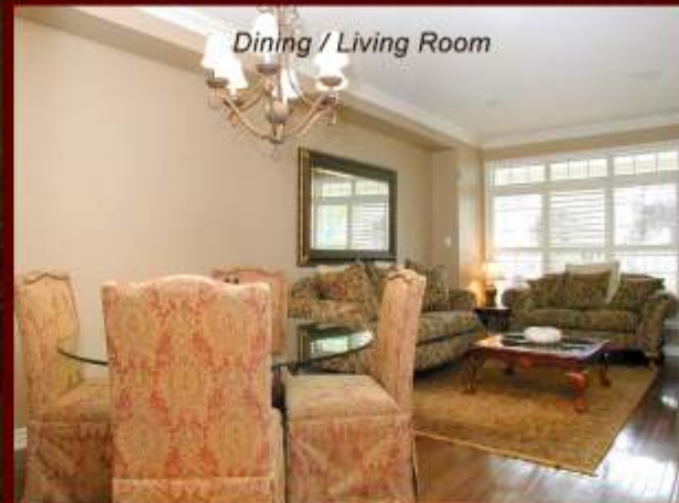
Dining / Living Room