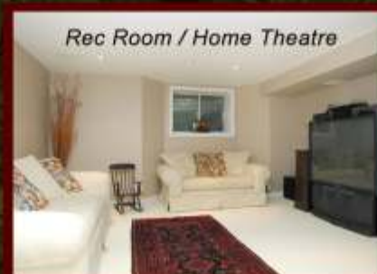
Rec Room / Home Theatre