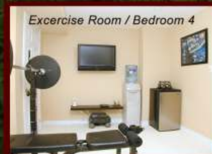
Exercise Room / Bedroom 4