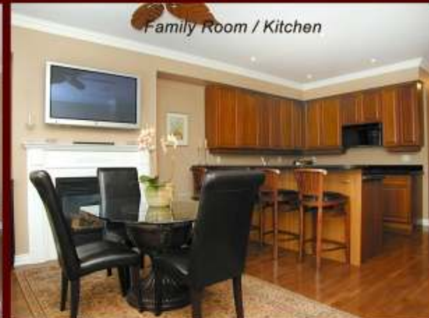
Family Room / Kitchen