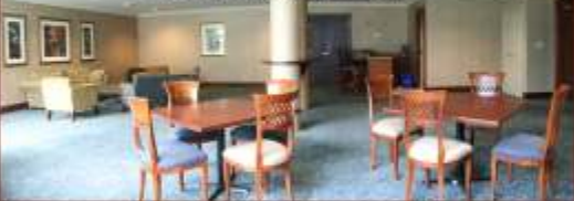
Billiards - Cards - Library