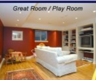
Great Room / Play Room