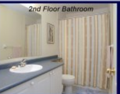
2nd Floor Bathroom