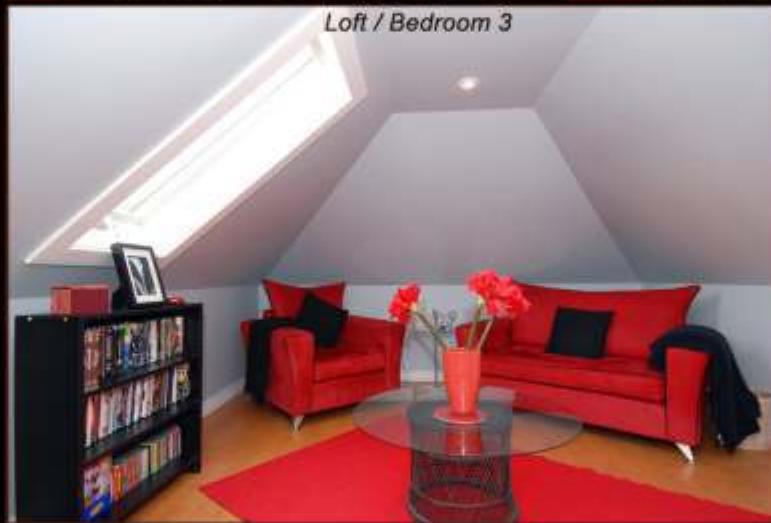
Loft / Bedroom 3