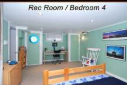
Rec Room / Bedroom 4