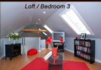
Loft / Bedroom 3