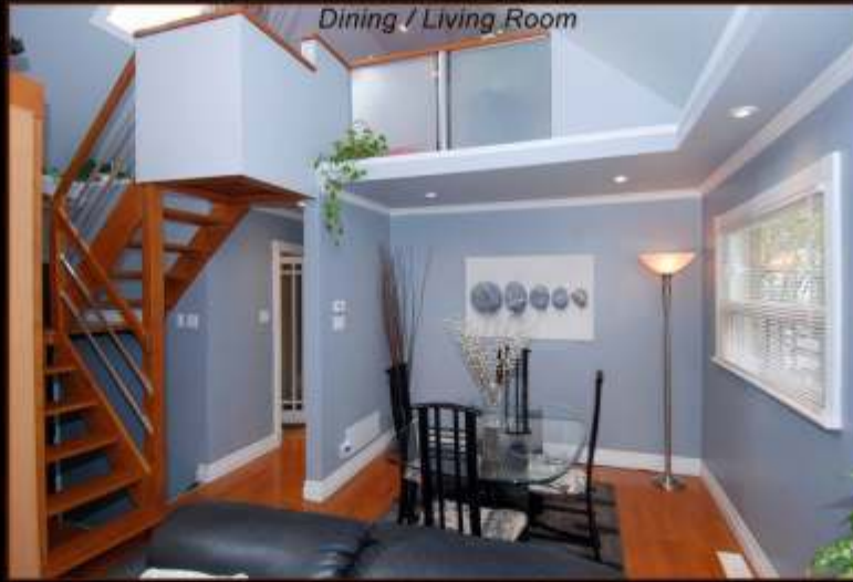
Dining / Living Room