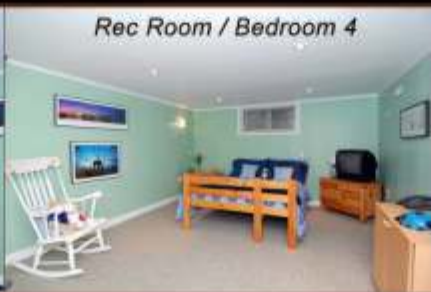
Rec Room / Bedroom 4